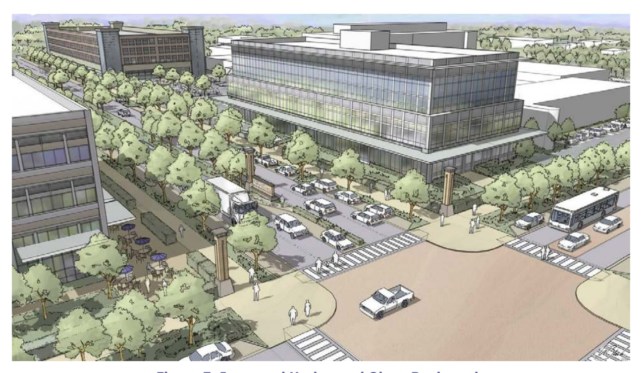
Figure 7: Improved Harbor and Olean Boulevards

The County shall reconstruct Harbor and Olean roadways from suburban-style automobileoriented streets into grand, multi-modal, urban, bicycle and pedestrian-oriented boulevards (see Figure 7).