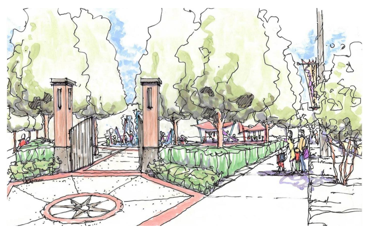
Figure 8: Gateway to McGuire Park