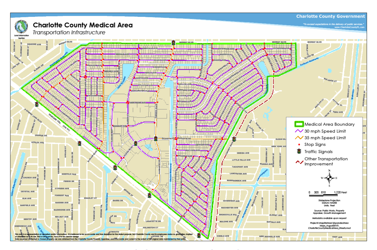
Map 5: Existing Transportation Infrastructure

Street and Brinson Avenue are missing sidewalks adjacent to medium density condominiums. Sidewalks are altogether absent east of West Tarpon Boulevard. Though most of the district contains sidewalks, these paths are inadequate to meet the demands of the diverse population that has come to reside, work and shop in the district.