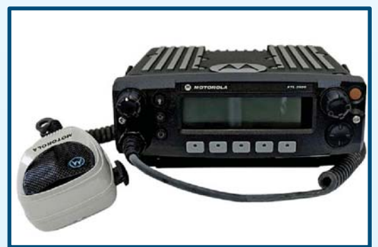
Motorola XTL 2500 Mobile