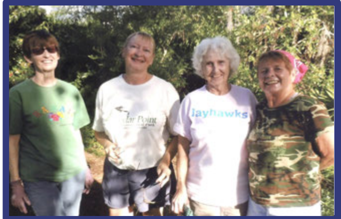
Just a few of our many terrific volunteers on our gardening team.

It was a memorable day filled with gratitude for each other, as well as the important and good work we collectively get to do together. From all of us who work at CHEC, we want to express to our volunteers – “Thanks for Giving!” We couldn’t do what we do without you!