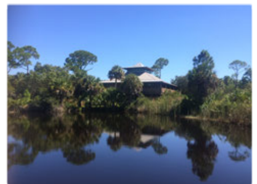
Above: Caniff Center at Alligator Creek Preserve in Punta Gorda