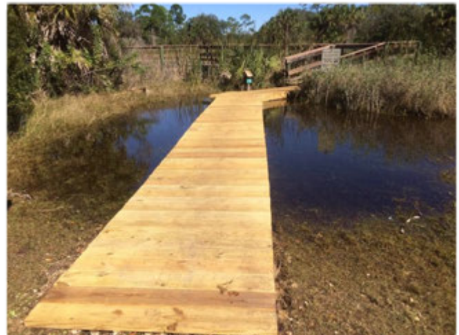
Above: New dock extension