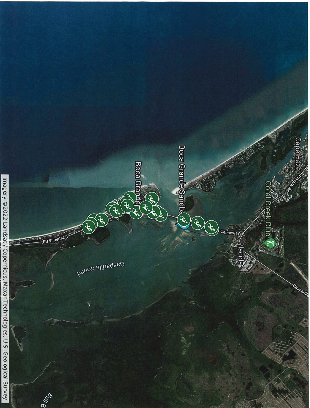
Figure 1: Locations of collected iguanas.